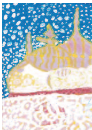
PAVILION IN SNOW BY KEITH PURCELL