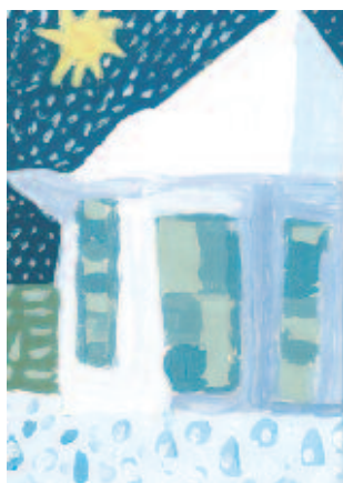
PROMENADE BY SUSAN STREET