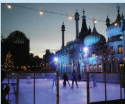
PAVILION ICE SKATING RINK