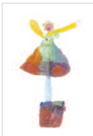
TREE FAIRY BY EDNA KNIGHT