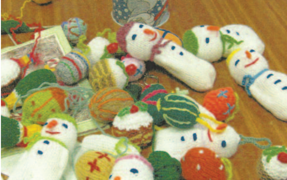
SNOWMEN MADE BY THE KNITTING GROUP

Have you got something to Share? Email us at: share@grace-eyre.org