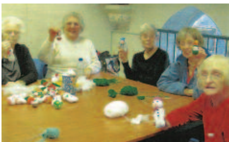
THE KNITTING GROUP