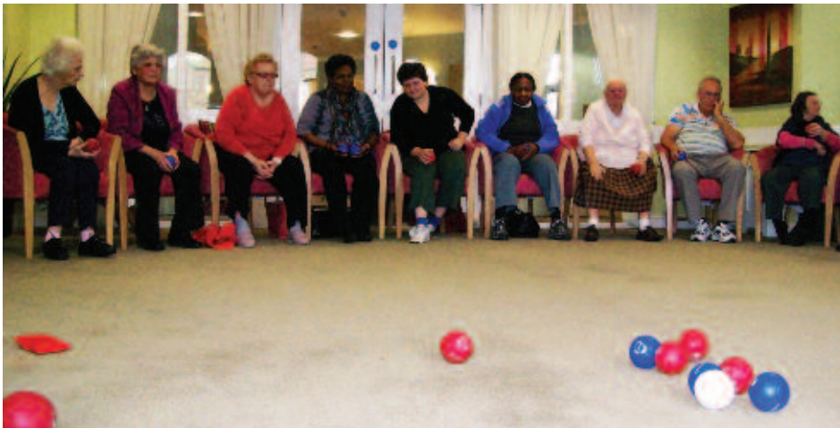
PLAYING BOCCIA

☎ Spiral transport: 01273 295 180 /07922 098 062