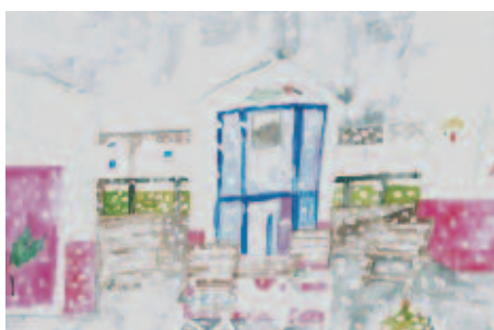
WINTER AT THE BEACH BY THERESA WOODS

Cost? £1.80 for a pack of five cards, £3.50 for two packs and a special offer of four packs for £5!