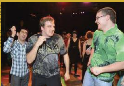
BLUE CAMEL CLUB

When? Daytime & evening, 22nd, 23rd, 24th Nov 2011 Where? Corn Exchange, Church Street, Brighton Cost? £1 per person per screening. For details check the website from July www.oskabright.co.uk