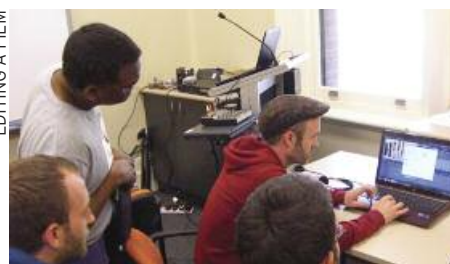
EDITING A FILM

Everyone in the group was very enthusiastic and lively - full of ideas for film making! We made a script with them, and showed them how to use cameras. We spent a long time showing the young people different camera angles and shots that you can use in film making like an over the shoulder shot. As usual we used Flip Cams and everyone found them easy to use and said that they would buy one.