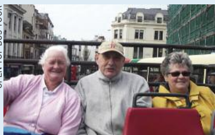
OPEN TOP BUS TOUR

On Friday April 15th I went on an Open Top Bus tour of Brighton which Grace Eyre arranged. There were lots of people who went on it including the Mayor and Mayoress!