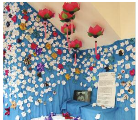
LOTUS FLOWER INSTALLATION