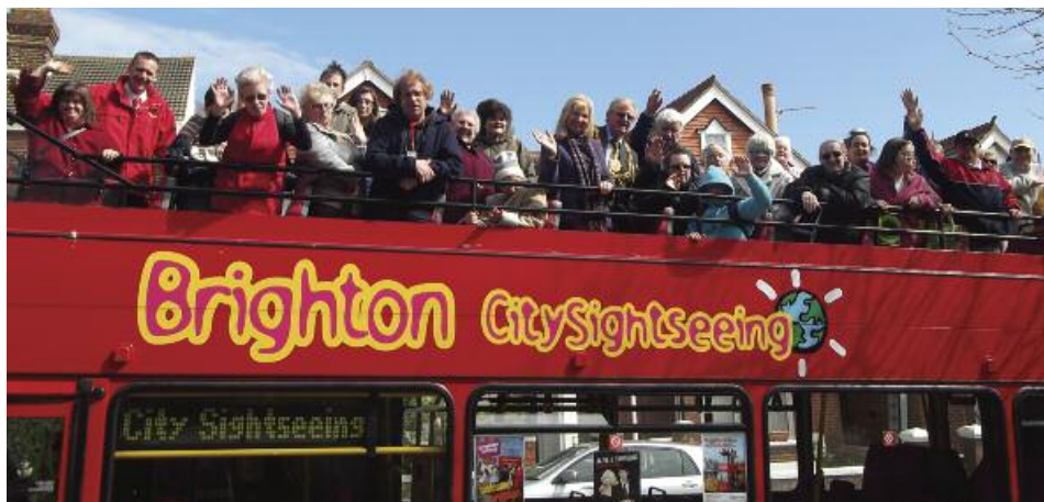
OPEN TOP BUS TOUR

Have you got something to Share? Email us at: share@grace-eyre.org