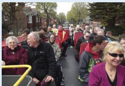
OPEN TOP BUS TOUR

Cost? Adult: £8, child (5-15yrs): £3, senior (60+): £6, student (with valid student ID): £7, family (2 adults + up to 3 children): £18