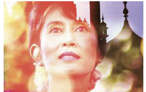
AUNG SAN SUU KYI

The guest director of the Brighton Festival 2011 was Aung San Suu Kyi, the Nobel Peace Prize winner and leading human rights campaigner whose message was Use Your Liberty To Promote Ours .