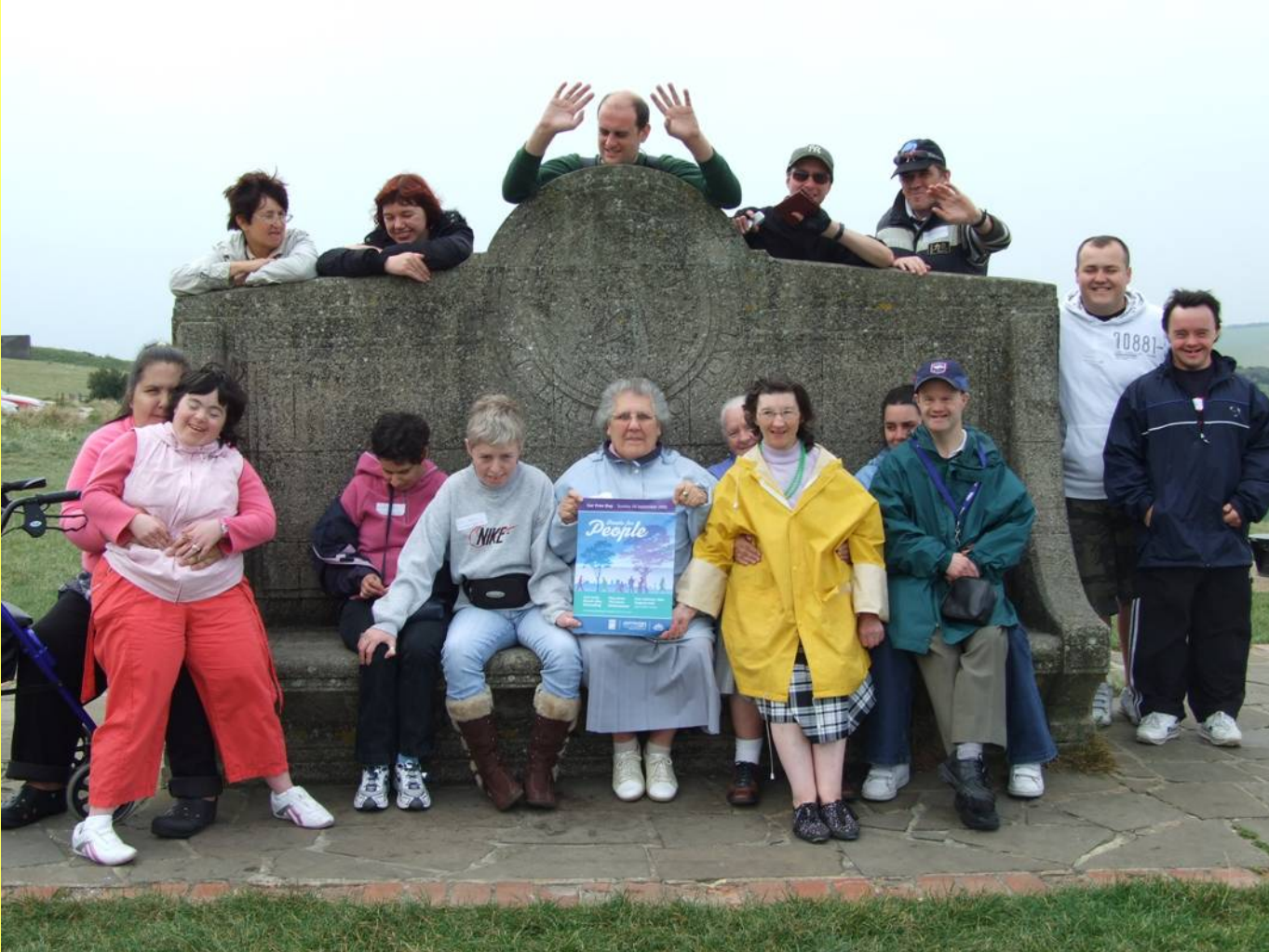
GE-Travel Buddy Scheme