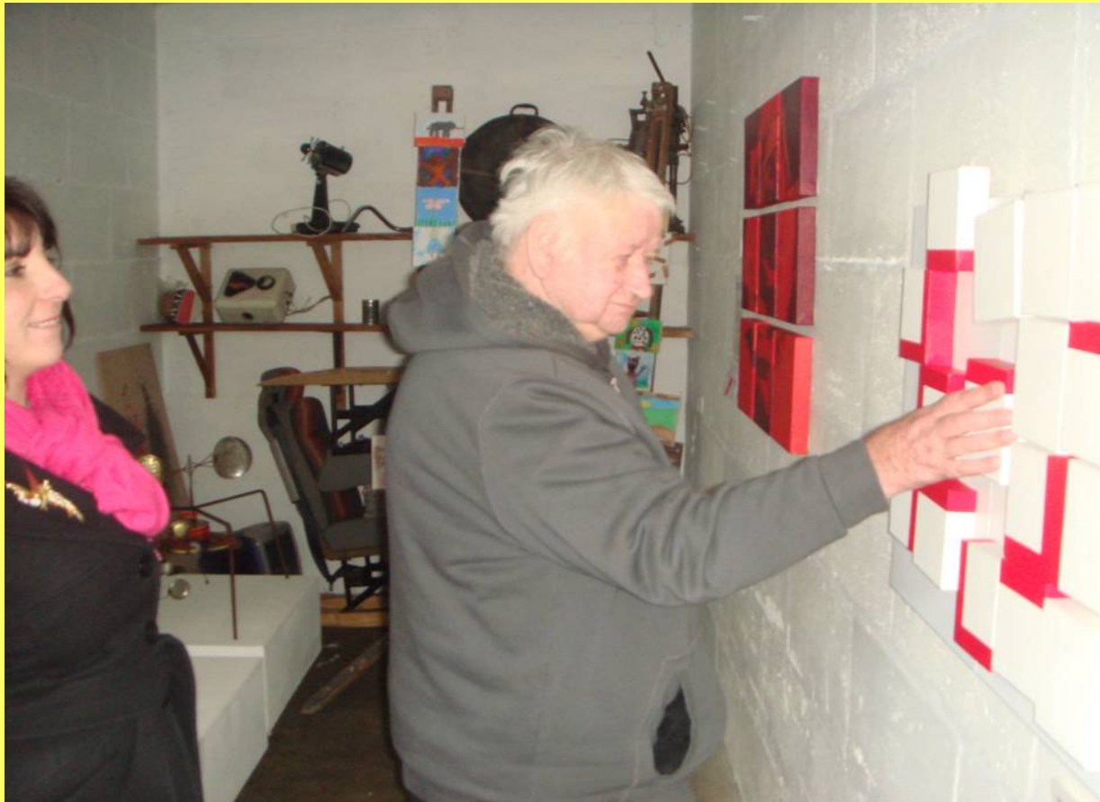
GE-Travel Buddy Scheme